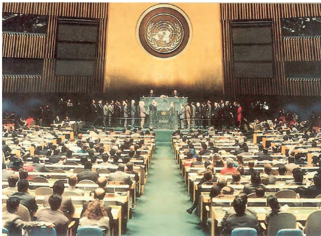
A photograph of the UNO General Assembly in session.

8 Look at the photograph, and then answer the questions which follow.