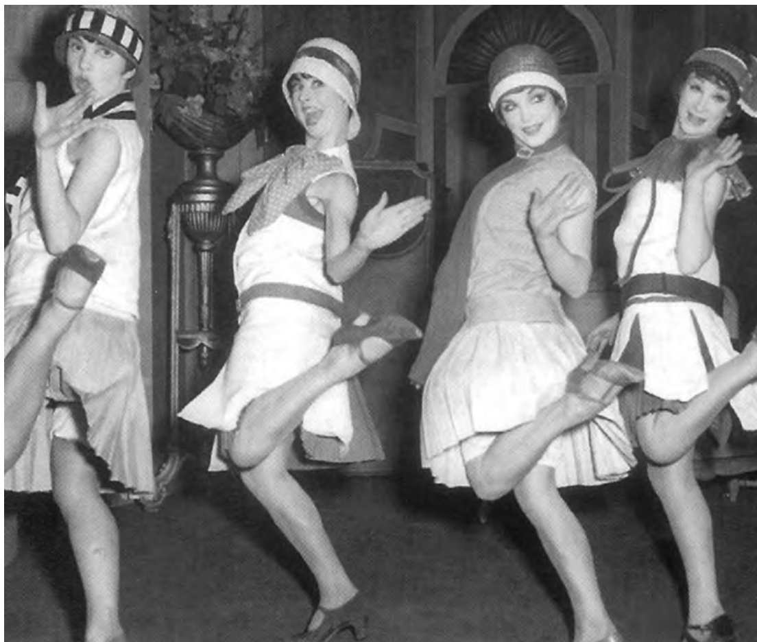
A photograph of flappers dancing in the 1920s.

13 Look at the photograph, and then answer the questions which follow.