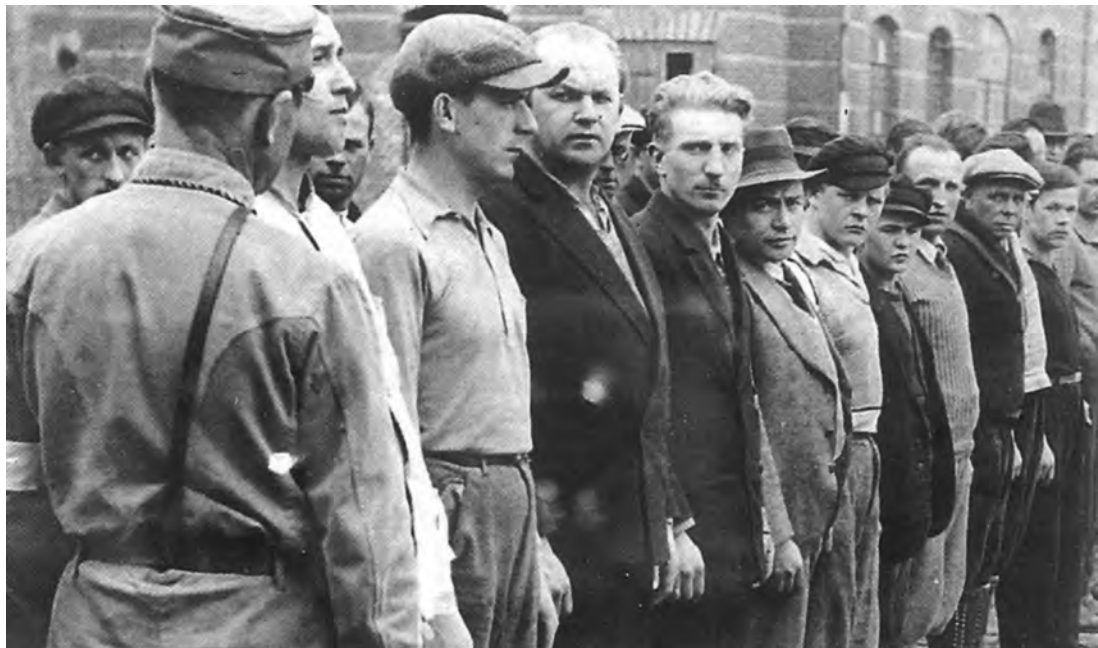
A photograph of political prisoners at the Oranienburg concentration camp near Berlin.

10 Look at the photograph, and then answer the questions which follow.