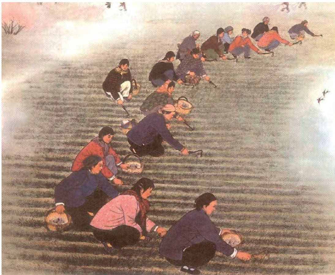
A painting of Chinese farmers working co-operatively but using traditional methods.

15 Look at the painting, and then answer the questions which follow.