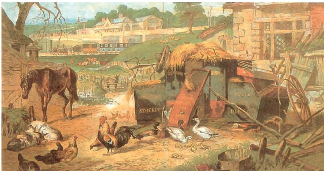
A painting from 1845 of a countryside scene.

22 Look at the painting, and then answer the questions which follow.