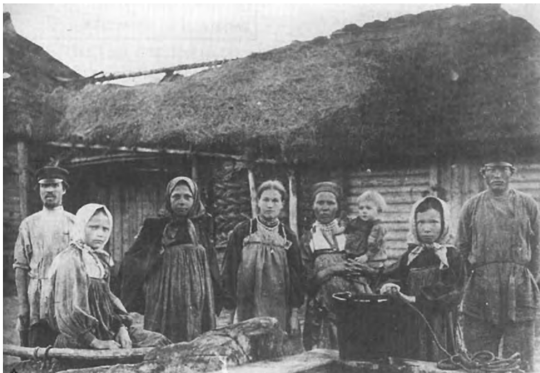
A photograph of a Russian peasant family outside their home in the early-twentieth century.