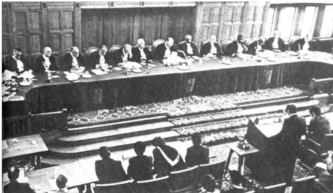
A photograph of the International Court of Justice dealing with Namibia in 1971.

19 Look at the photograph, and then answer the questions which follow.