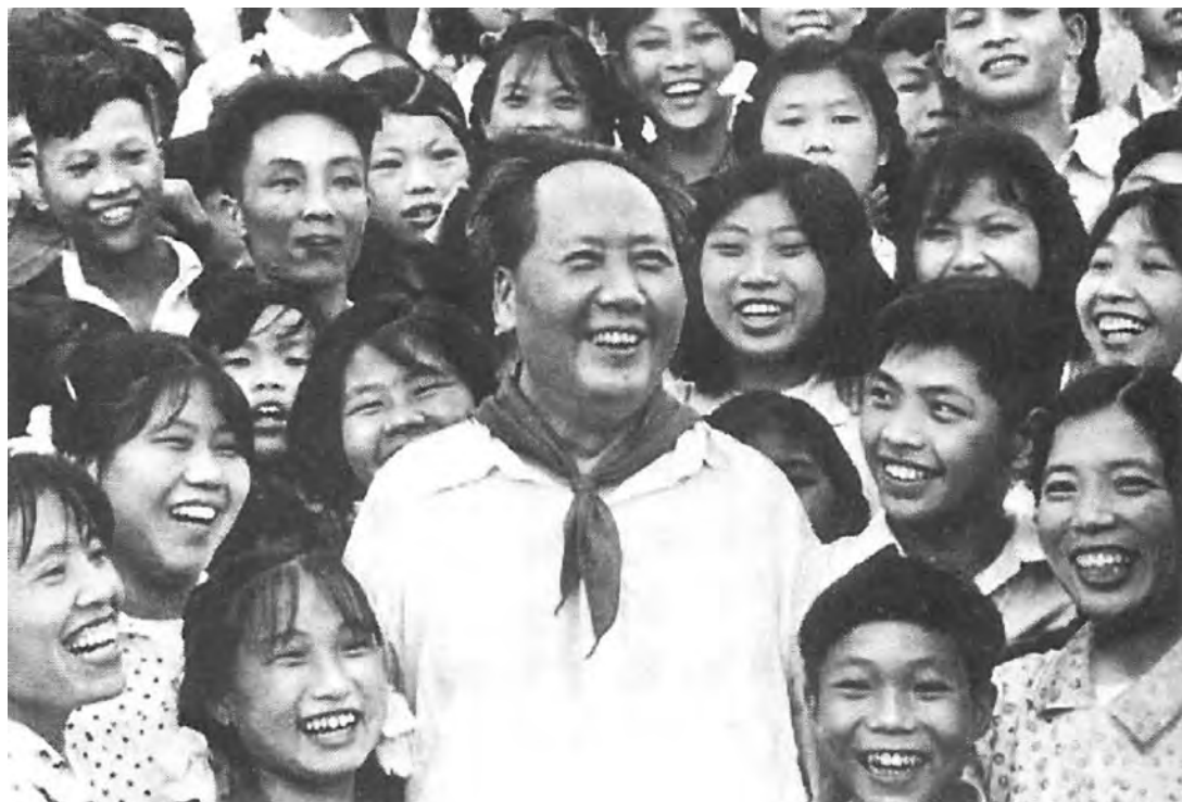
A photograph of Mao with young supporters.

16 Look at the photograph, and then answer the questions which follow.